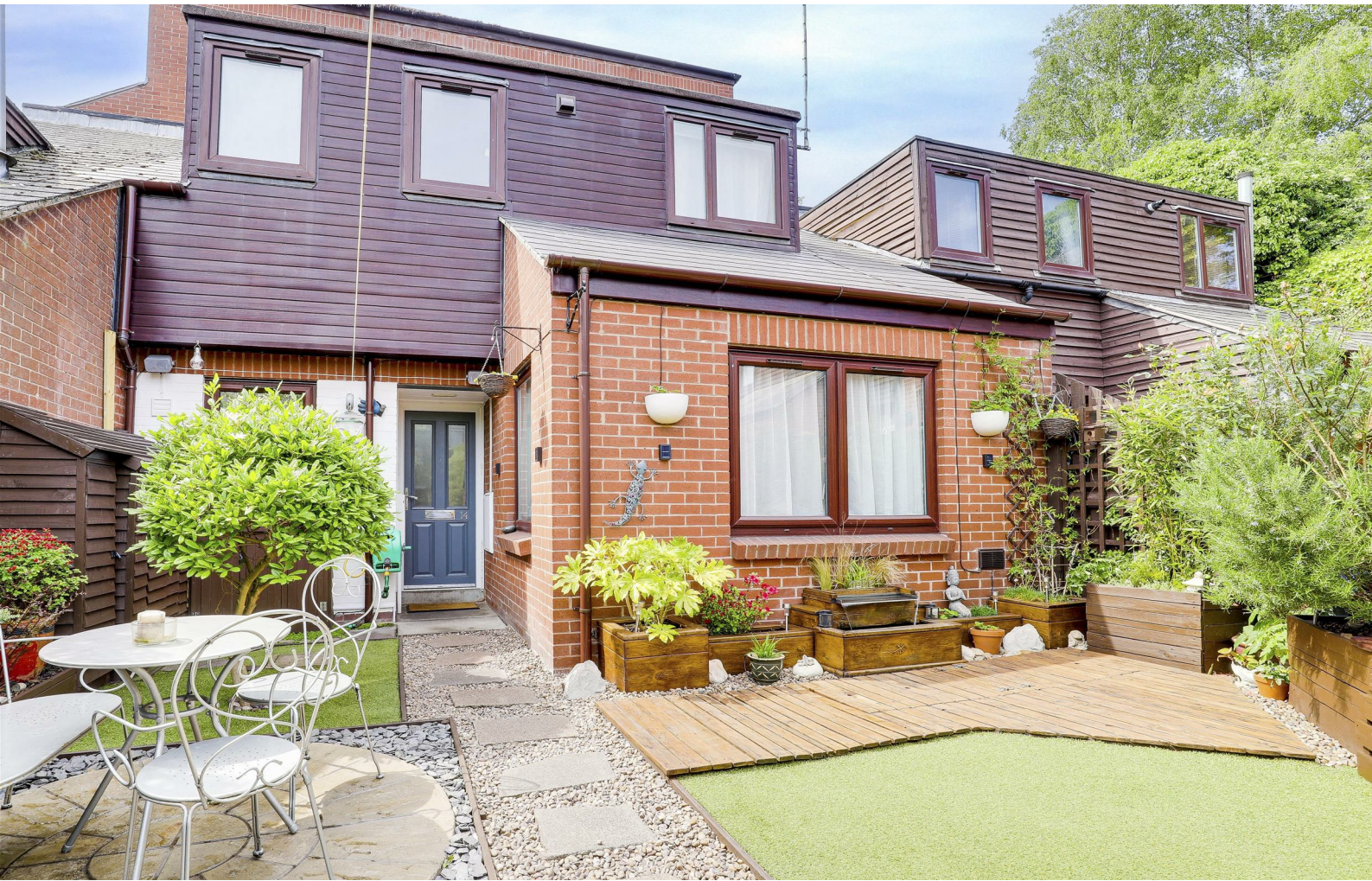
Carter Gate, Nottingham, Nottinghamshire NG1 1GL